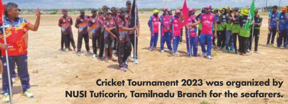
Cricket Tournament 2023 was organized by NUSI Tuticorin, Tamilnadu Branch for the seafarers.