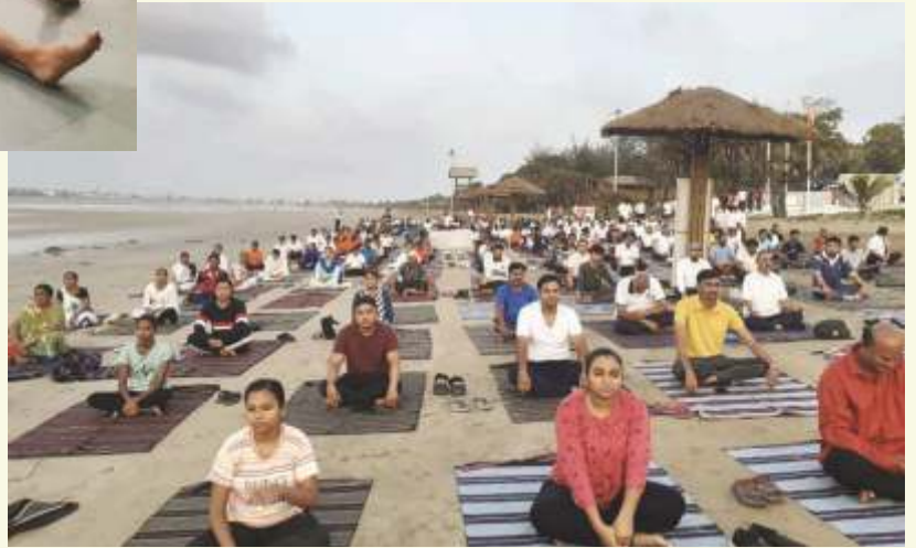
▶ International Yoga Day along with NUSI Diu Youth Committee members, seafarers and their families at Ghoghla beach