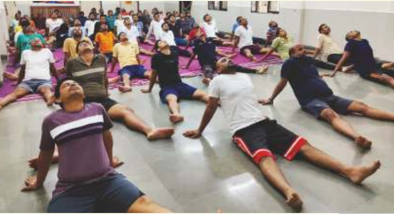
◀ International Yoga Day at Indian Sailors Home Society (ISHS)